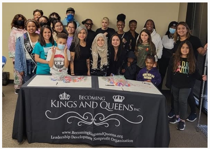
What's Next for BKQ?