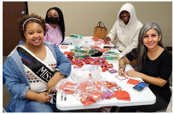
BKQ Words of Wisdom

As a nonprofit organization which focuses on youth leadership, Becoming Kings and Queens would like to take the time to leave you with a word of wisdom. We want to encourage you to continue thriving. As the seasons change over to spring and we see the new life in the earth and plants around us, allow yourself the moment to reflect.